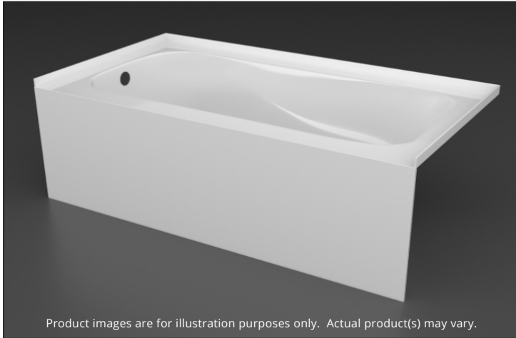
Product images are for illustration purposes only. Actual product(s) may vary.