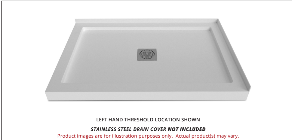
LEFT HAND THRESHOLD LOCATION SHOWN

STAINLESS STEEL DRAIN COVER NOT INCLUDED