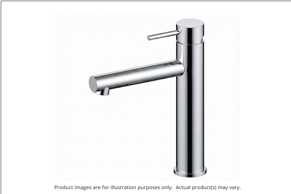
Product images are for illustration purposes only. Actual product(s) may vary.