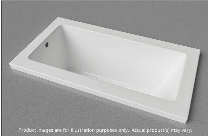
Product images are for illustration purposes only. Actual product(s) may vary.