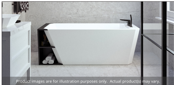
Product images are for illustration purposes only. Actual product(s) may vary.