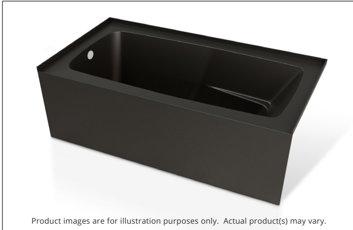
Product images are for illustration purposes only. Actual product(s) may vary.