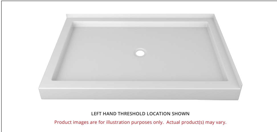
LEFT HAND THRESHOLD LOCATION SHOWN

Product images are for illustration purposes only. Actual product(s) may vary.