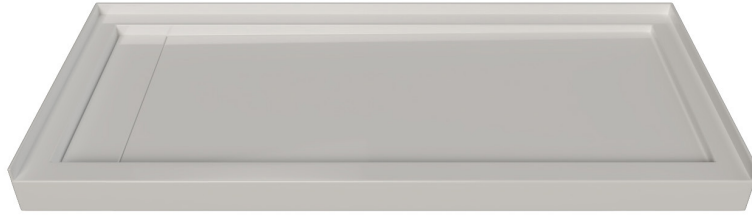
LEFT HAND DRAIN LOCATION SHOWN

Product images are for illustration purposes only. Actual product(s) may vary.