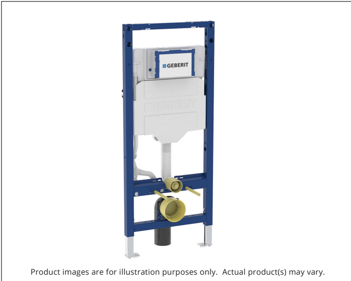
Product images are for illustration purposes only. Actual product(s) may vary.